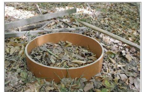
Fig. 2. Respiration chamber

Proper installation of the equipment had to be postponed due to weather conditions in the last 6 months. Severe drought resulted in a marked strengthening of the soil, which has become too hard for the respiration chamber fixed components to be installed, with the risk being to break them or to affect the tightness. Thus, we preferred a postponement, so that after the first rain or snow will melt, the conditions necessary to properly insert the rings will be met and all the chambers will be installed.